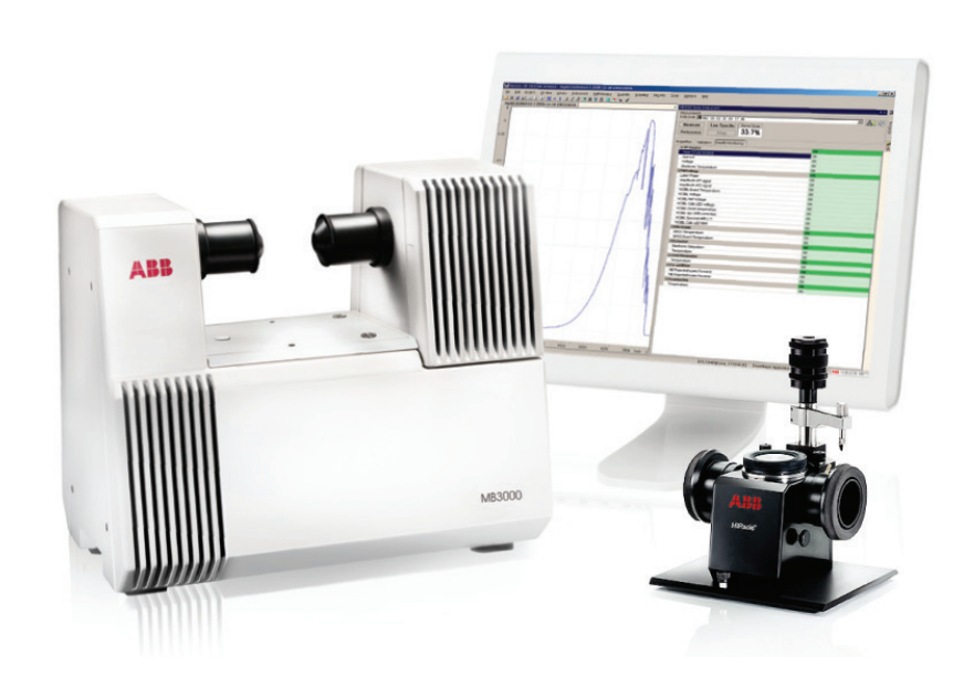
ABB offers the MIRacle™ accessory with electronic recognition via USB port, a universal ATR sampling kit to analyze solids, liquids, pastes, gels and intractable materials addressing the most common sampling needs. Other sampling options offered by ABB include a horizontal ATR kit, demountable liquid cells, a diffuse reflectance DRIFT accessory, gas cells, specular reflectance accessories with fixed and variable angles, and micro-sampling with a beam condenser or microscope.