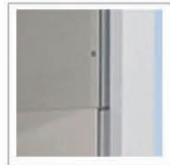
Double Layers 1.2mm sheet metal surface, melamine board inward