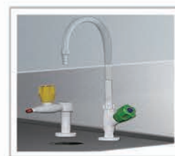
Water&Gas Tap Water Sink