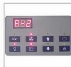
LED Display Digital LED display: Airflow Level